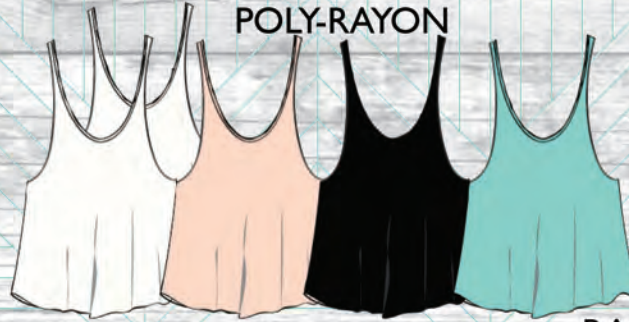
DOUBLE SCOOP TANK: POLY-RAYON