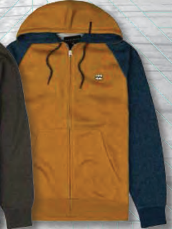
GDN - GOLDEN