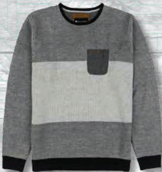
OAT - OATMEAL

Style Desc: Engineered yarn dye crew neck sweater with contrast chest pocket and button closure with contrast cuffs and Billabong woven patch on bottom left side seam. Made with 100% acrylic.