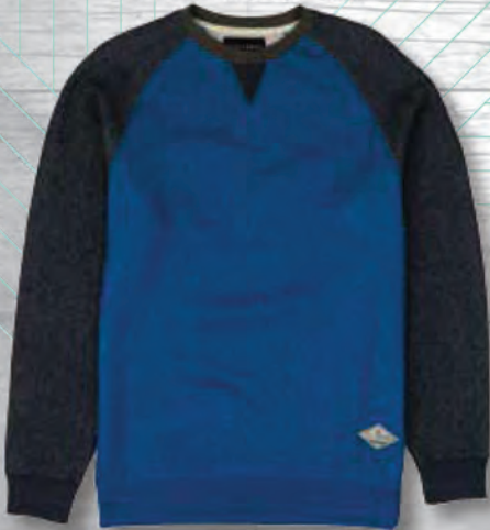
INH - INDIGO HEATHER