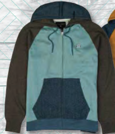
TOP - TROOPER