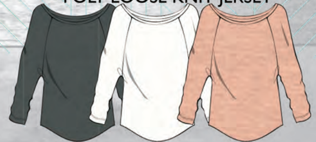
RAGLAN LS TEE: 60/40 COTTON- POLY LOOSE KNIT JERSEY