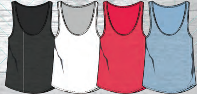
CROPPED TANK: FAUX-BLEND 70/30 POLY-COTTON