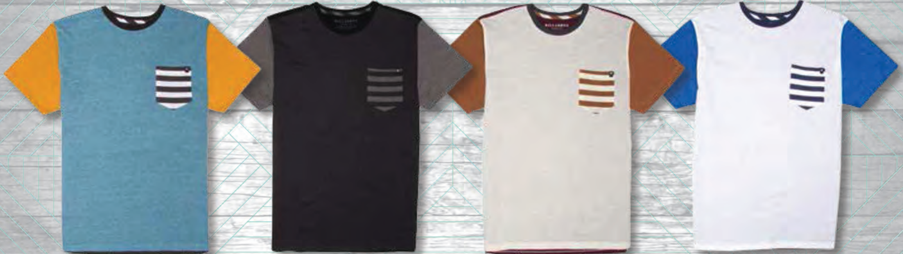
WBE - WASHED BLUE HEATHER