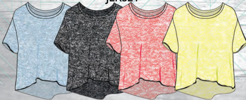
HI-LO TEE: POLY-RAYON MOCK TWIST JERSEY