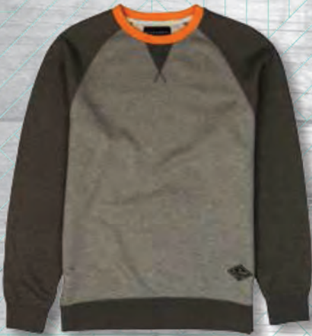
DGR - DARK GREY HEATHER

Style Desc: Light weight brushed back Contrast raglan sleeve fleece in crew neck, Henley pull over, and zip hood bodies with pocket and Billabong metal badge on left front chest. Made with 60% cotton / 40% polyester.