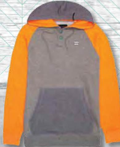
HMN - HOT MANGO