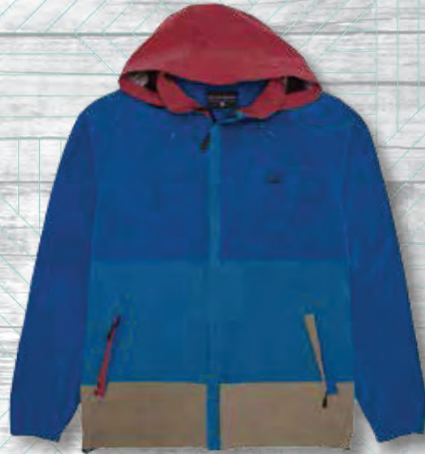
MRE - MARINE*