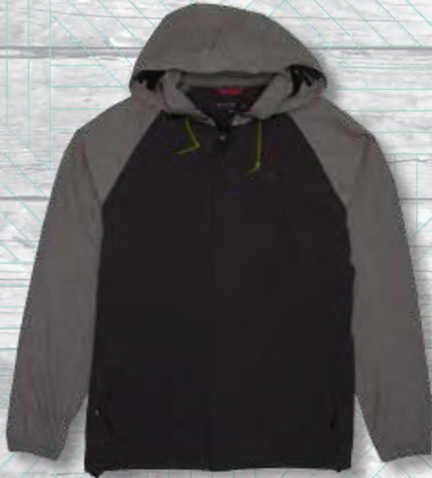
ALT - ASPHALT

Style Desc: Platinum X Quad stretch hooded color blocked windbreaker with H2 Repel. Garment features welt pockets, heat transfer logo at chest, contrast camo mesh lining and toggle adjuster at hem. Made with 89% polyester / 11% spandex.