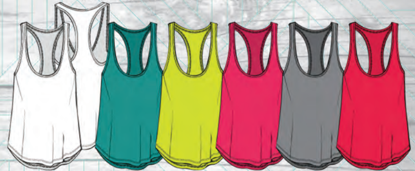
RACERBACK TANK: 100% COTTON