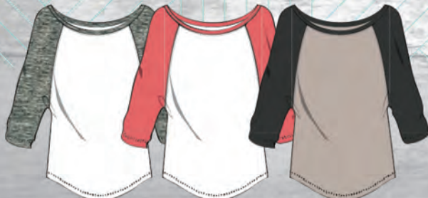
BASEBALL TEE: TRIBLEND