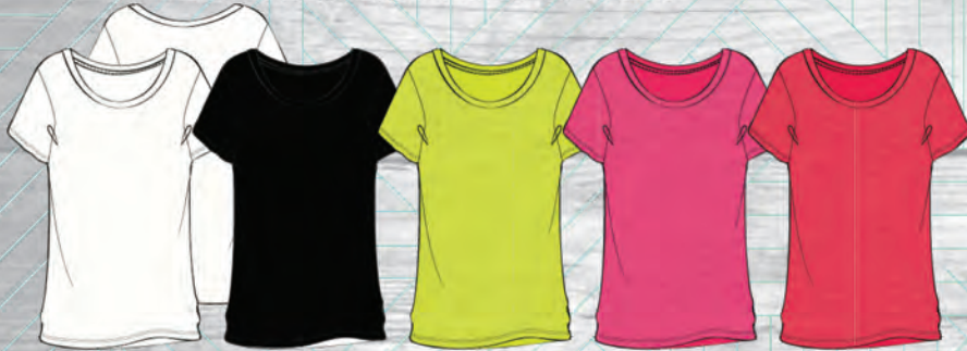
CAP TEE: 50/50 POLY-RAYON