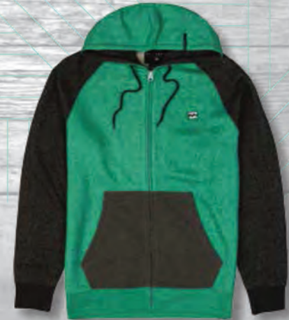
JAH - JADE HEATHER