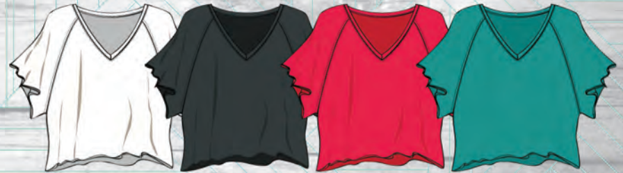
OVERSIZED V: 60/40 COTTON-POLY LOOSE KNIT JERSEY