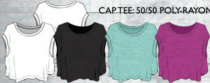
CAP TEE: 50/50 POLY-RAYON