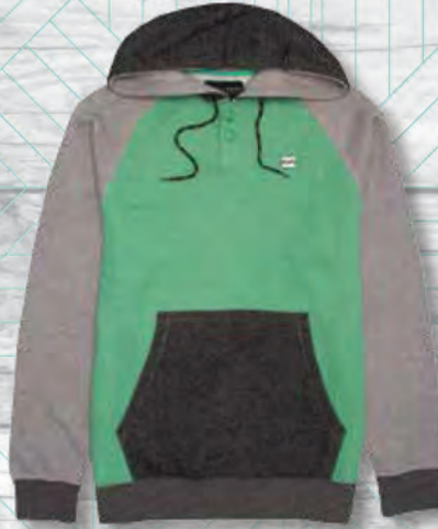
WJD - WASHED JADE