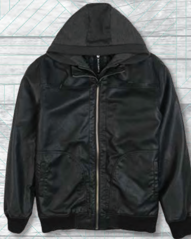
BLK - BLACK