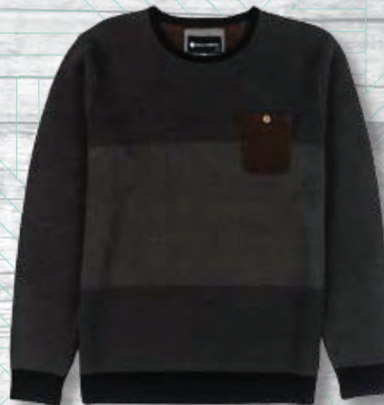
BLK - BLACK