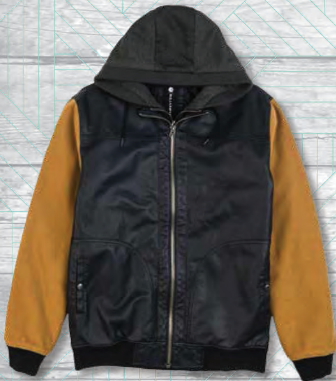
NAVY - NAVY

Style Desc: Genuine pleather jacket with fleece hood and fake inner placket. Jacket features contrast wool blended sleeves, zipper front closure, and bottom patch pockets with side welt entry and metal badging. Made with 100% polyurethane.